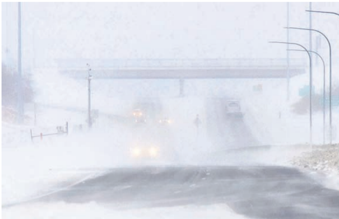
Visibility on I-94 in the Bismarck, N.D., Mandan area is greatly reduced due to blowing snow across the roadway in this view of westbound traffic on the Grant Marsh Bridge over the Missouri River on Thursday, Dec. 15, 2022.